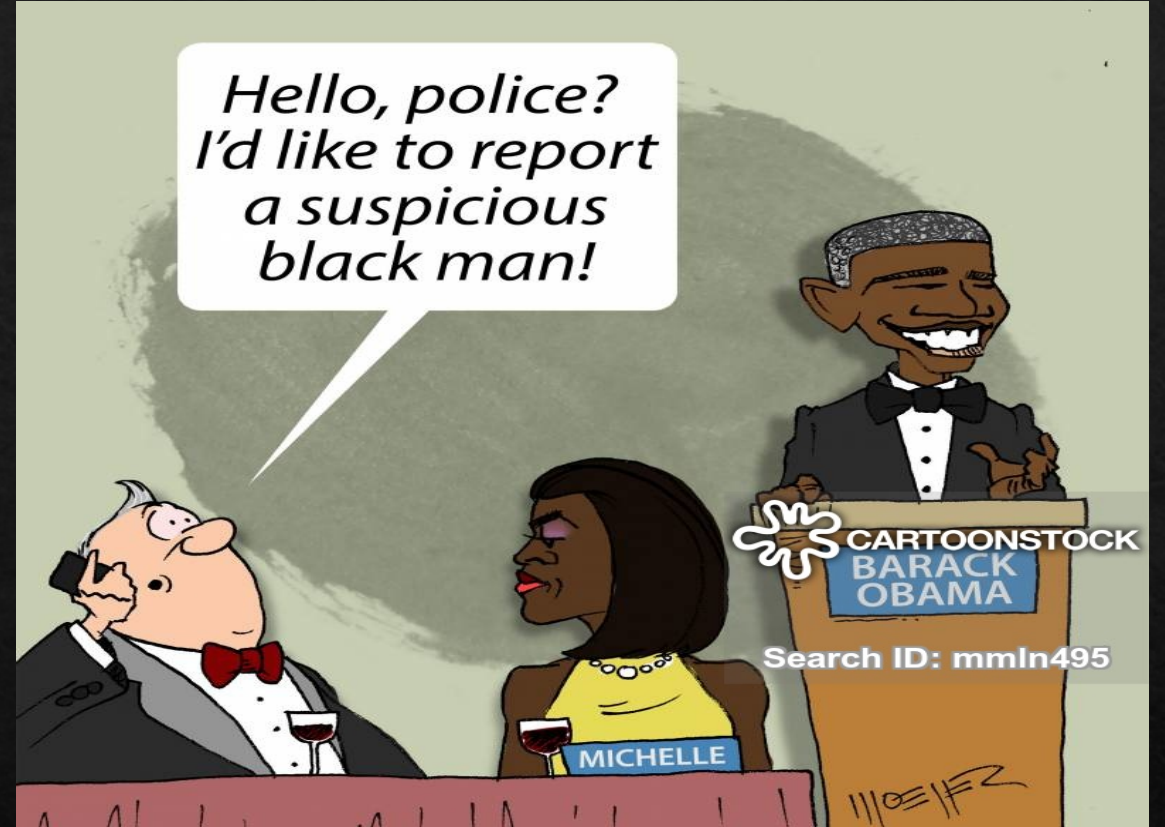
Two Political cartoons that express systemic racism today.